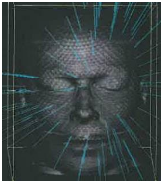
CyberKnife, no fixed metal headframe